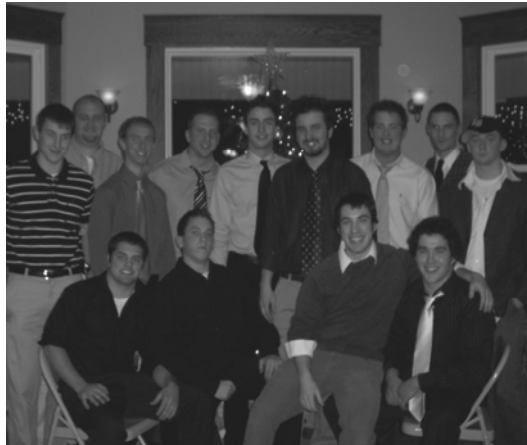
Some of the brothers at the annual Christmas Dinner