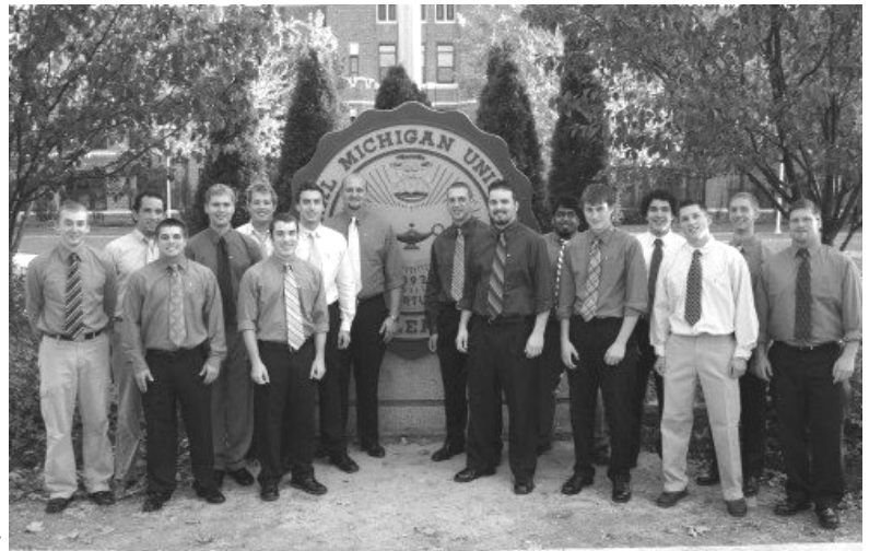
The brotherhood after the Fall 06 semester

“Once a Beta, always a Beta, everywhere a Beta”