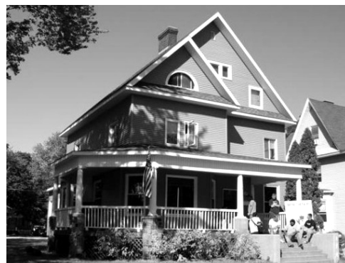
The Chapter House at 814 S. Main