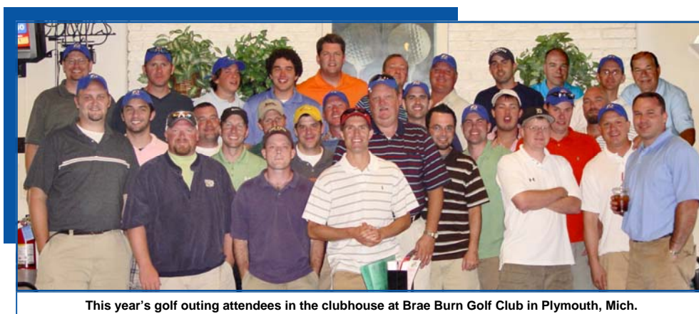
This year's golf outing attendees in the clubhouse at Brae Burn Golf Club in Plymouth, Mich.