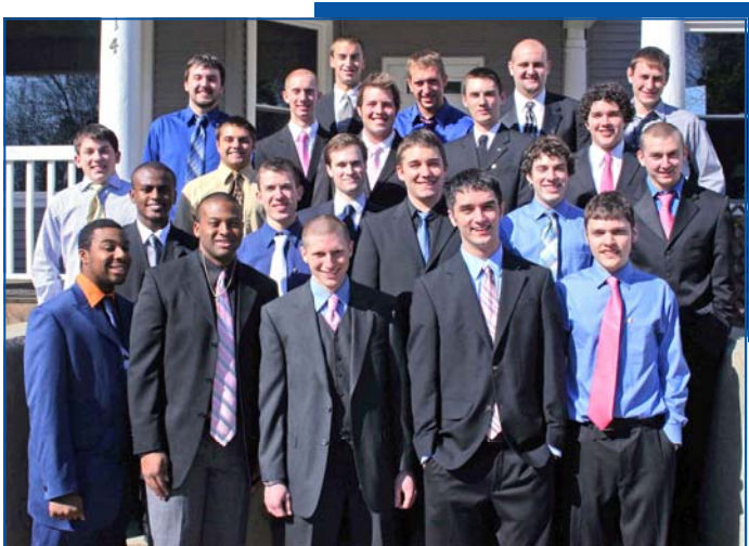
The colony on the front steps of the Beta House - Spring Initiation 2007

First of all, the brothers of the Epsilon Gamma colony initiated eight gentlemen on Saturday the 17th of March. This brings our number of active members up from twelve to twenty men.