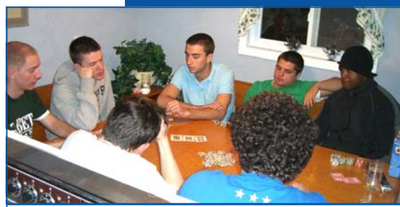
A few guys stayed up until 7:00 in the morning playing Texas Hold'em

The part I wish to share with you the most is the fact that my job has become a bit simpler. The reason for this is due to the colony actually acting like a fraternity. They had it all together. They had great attendance, and they had everything that they needed. (The most important, being the key to Brandyn's cottage.)